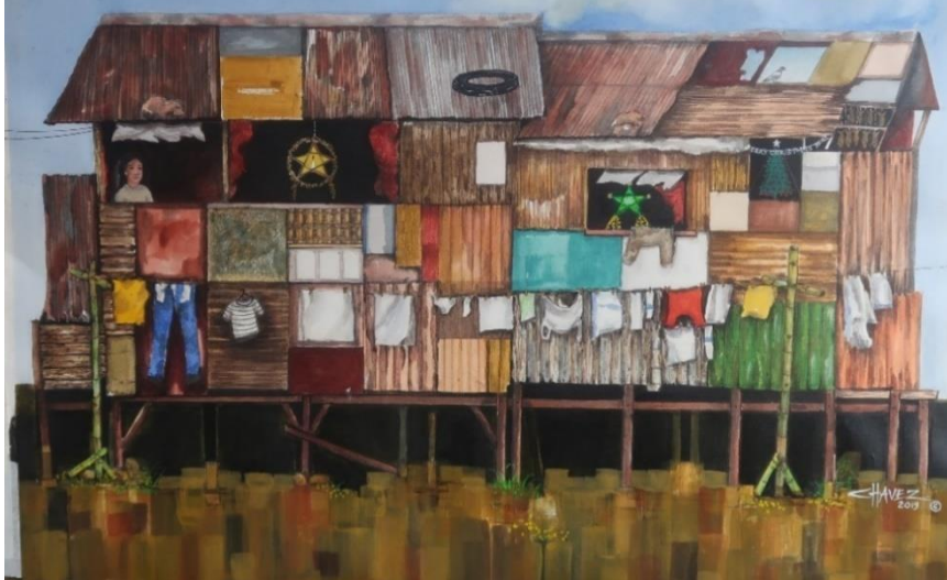
Artist: Effren Chavez of The Baguio Group of Artists 'Barong Barong Series #1', 2019 Tempera on Paper, 18x24 in. (Private Collection, NY)