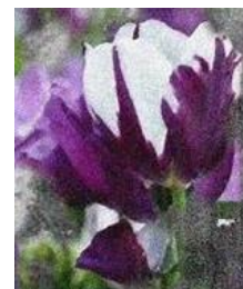
Class 1970 Elsie REDONDIEZ Fontanilla d. 2020